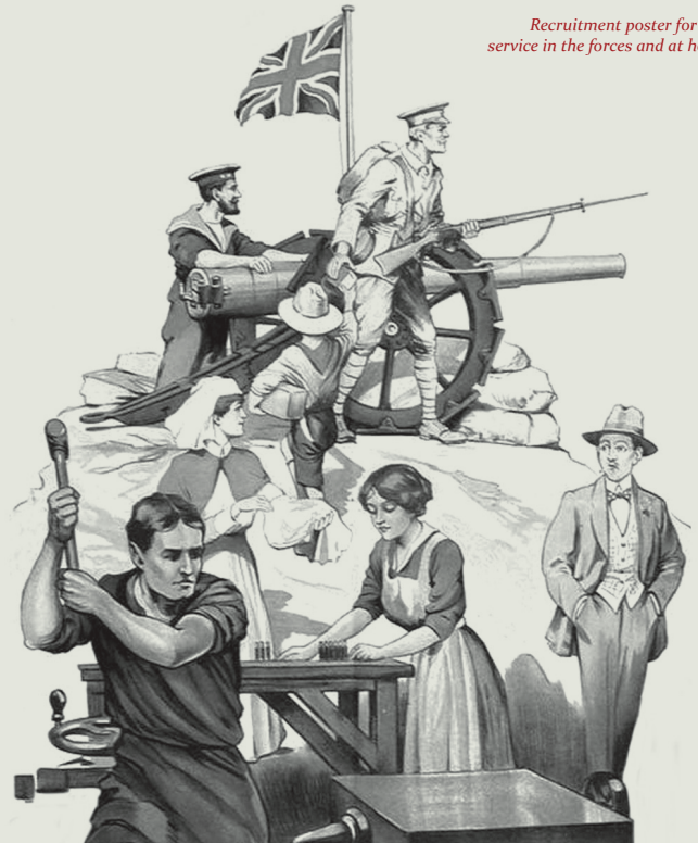
Recruitment poster for war service in the forces and at home