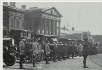
Motor Volunteers and official ambulances await a convoy of 100 wounded soldiers

Discover Huddersfield offers new ways to experience this amazing Yorkshire town, through guided walks, talks and trails. See Huddersfield at its very best: grand listed buildings and small independent shops; a place for radicals from the Luddites to the Sex Pistols; birthplace of Rugby League; a town rich in creativity, stories, heritage and the odd ghostly encounter.