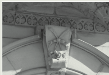
The crossed quills, symbol of a centre of writing